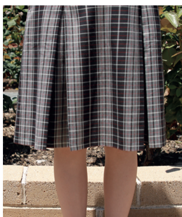
Acceptable Dress Length