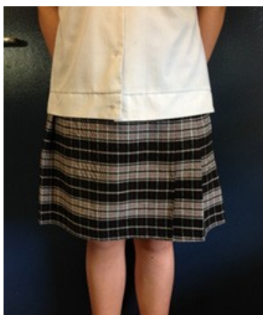
Acceptable Skirt Length